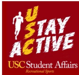
USC Stay Active Premium