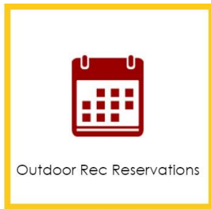
Outdoor Rec Reservations